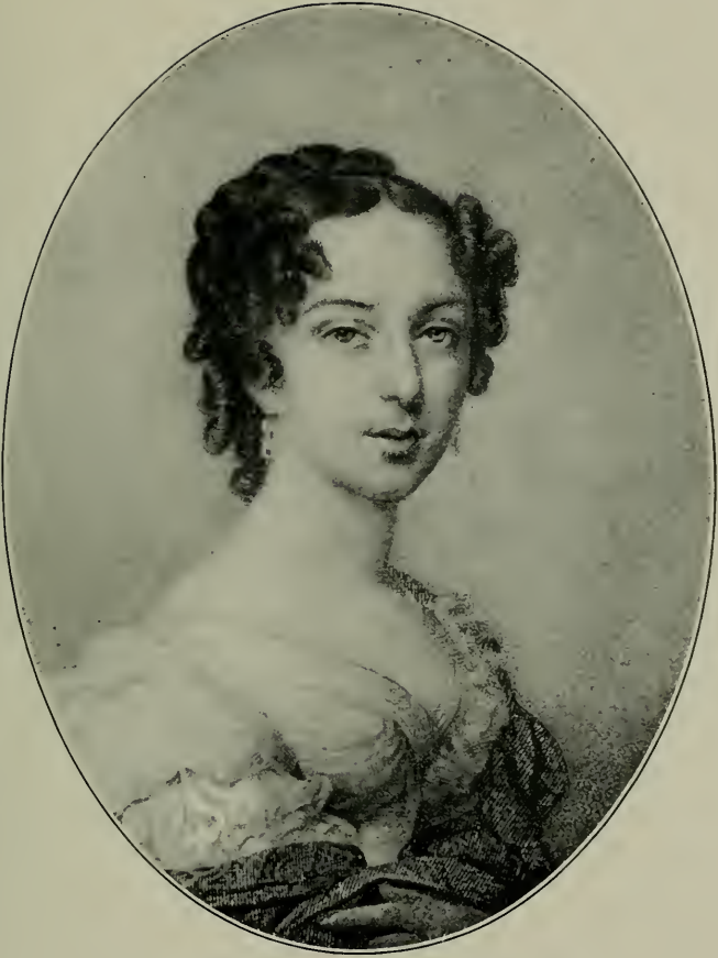
MADAME ALPHONSE DE LAMARTINE